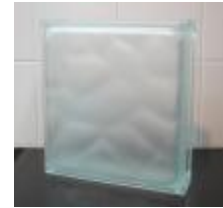
GREEN FROSTED WAVE (2" thick only)