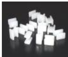
PLASTIC CLIPS (50 PER BAG)