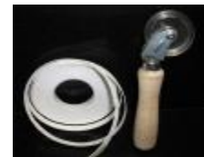
WHITE GROUT TAPE & ROLLER