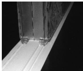
T-BAR ( 4 FT.TRACK)