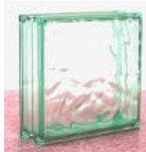
GREEN WAVE (2" thick only)