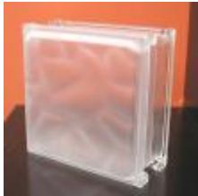
FROSTED WAVE (2" thick only)