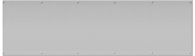
KPN1034 - 10" x 34" Kick Plate